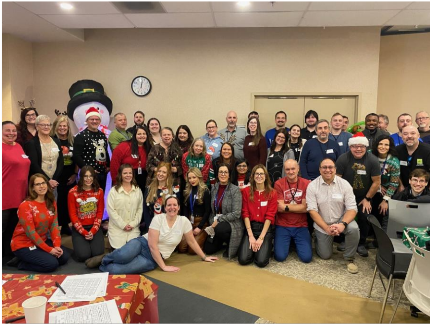
Informatics Team for the Hospital's Patient Clothing Cupboard