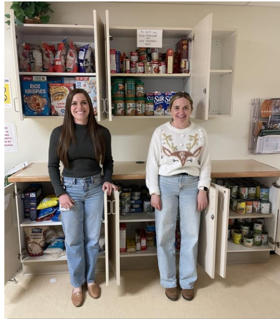
Renal Food Cupboard