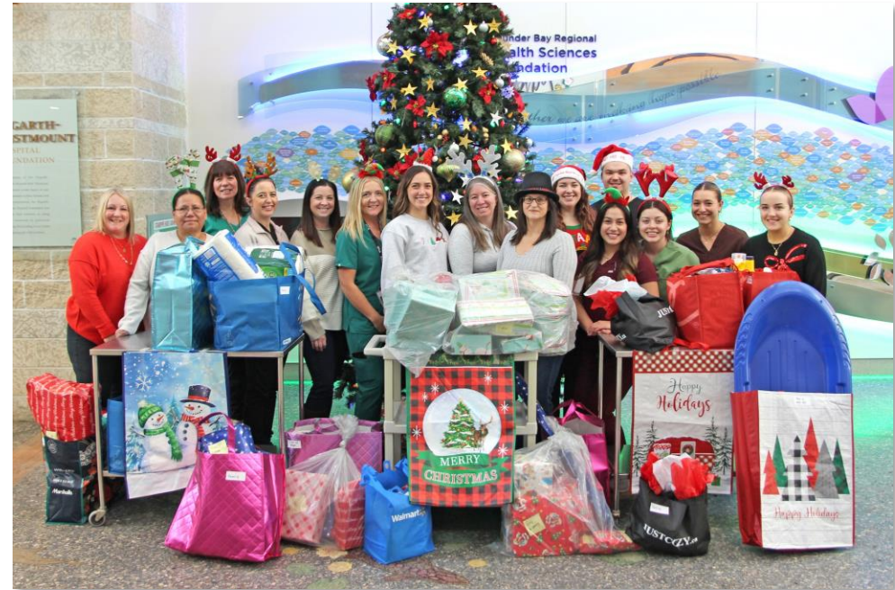
Emergency Department for the Holiday Hamper Program