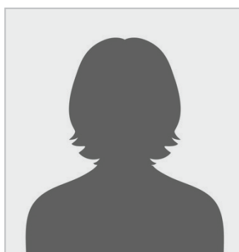
Cheyenne Spence RN, Emergency