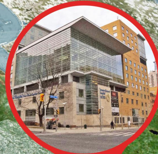
University Health Network Peter Munk Cardiac Centre